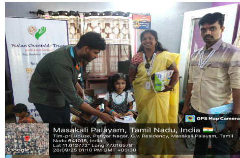
DISTRIBUTION OF BOOKS