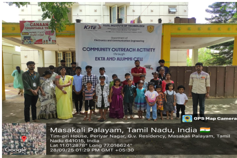
GROUP PHOTO WITH STUDENTS